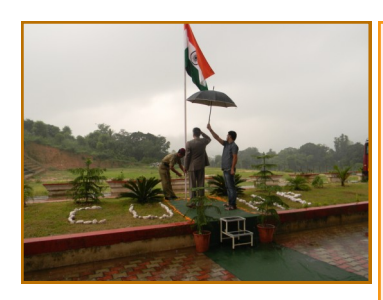
Vice Chancellor Hoisting the National Flag